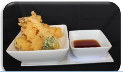
Shrimp & Veggie Tempura